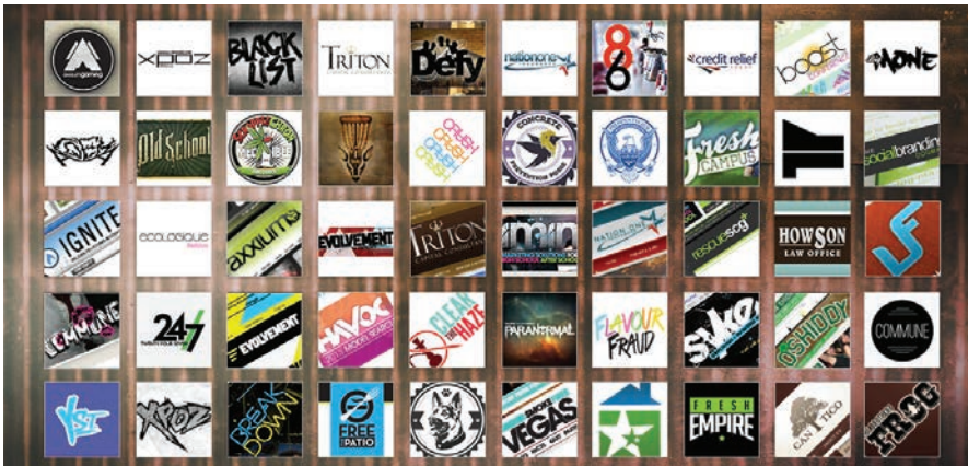
A small selection of logos and brands designs.