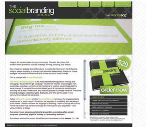
Website for our published book where Ty has a featured chapter