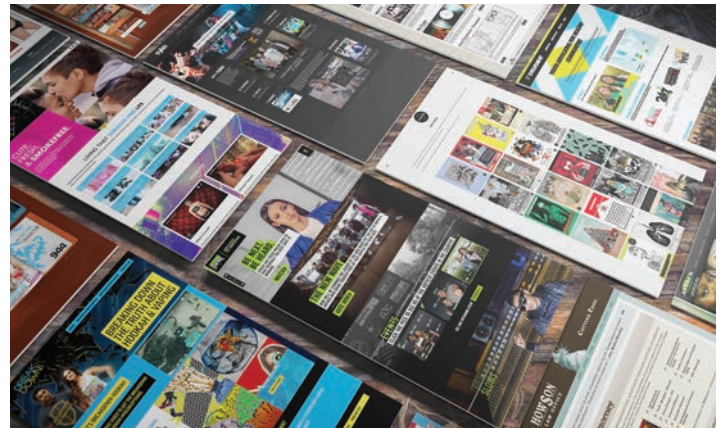
Graphic design and web development examples (2008-2013)